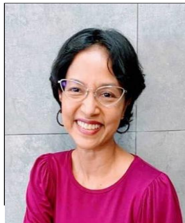
Maha Balakrishnan National Democratic Institute